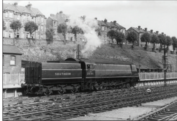
Here is West Country class 21C105 virtually brand new at Exeter Central on 27 August 1945.