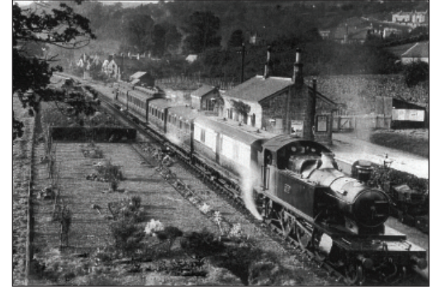
This photo from 1910 has 4500 class 2179 at Lustleigh on a train to Moretonhampstead.