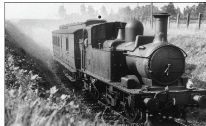
Here is 1439 leaving Tiverton Junction on 18 August 1947 with a branch train for Hemyock formed of one clerestory roofed coach.