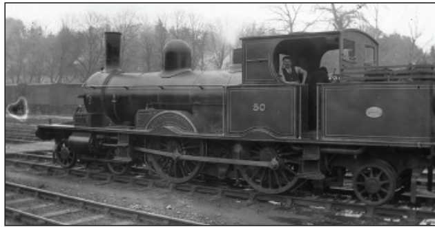
This photo dates from 1904 and shows LSWR 50 at Exeter St Davids.