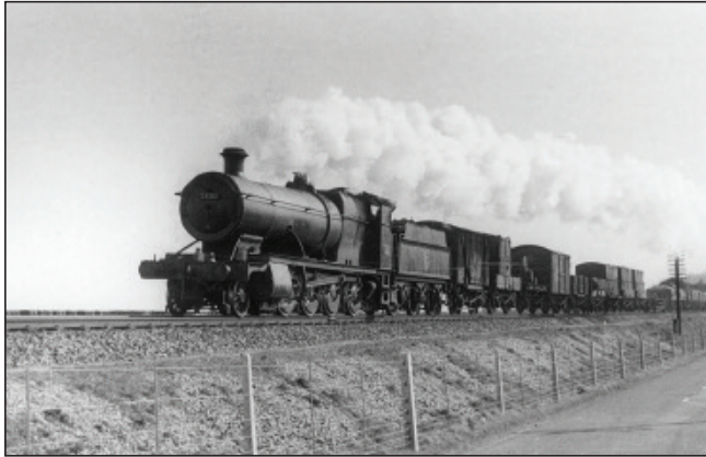
One of the last batch of the 2800 class 2-8-0s, Newton Abbot shed's long term resident 2881